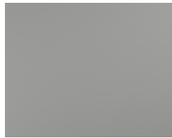
Pewter Gray (PG)