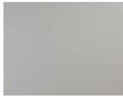
Ash Gray (AG)